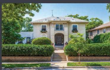
2740 Upton Ave S, MPLS $1.395M

Bruce Birkeland 612-925-8405 bbirkeland@cbburnet.com bbirkelandgroup.com