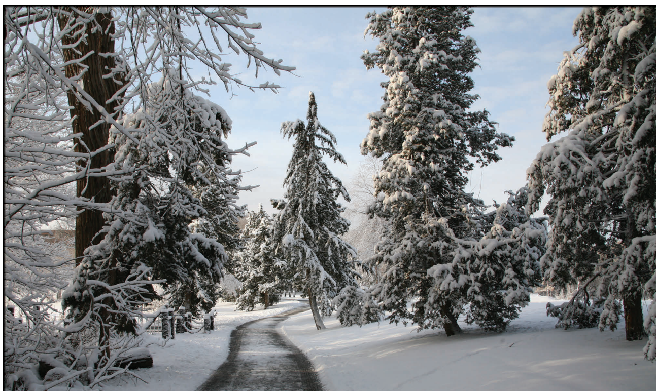
Path at Cedar Lake

CLPA has been working on documenting developments in the Kenilworth Corridor. A few years ago, we purchased a Go-Pro camera and took videos of the corridor. Our thought was to provide a history of what the Kenilworth Corridor was before the construction of the Southwest Light Rail Transit (SWLRT). Recently we