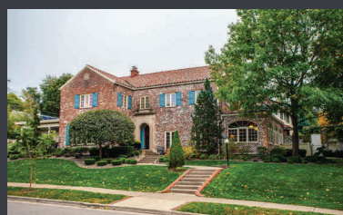
4201 Fremont Ave S, MPLS $1.785M