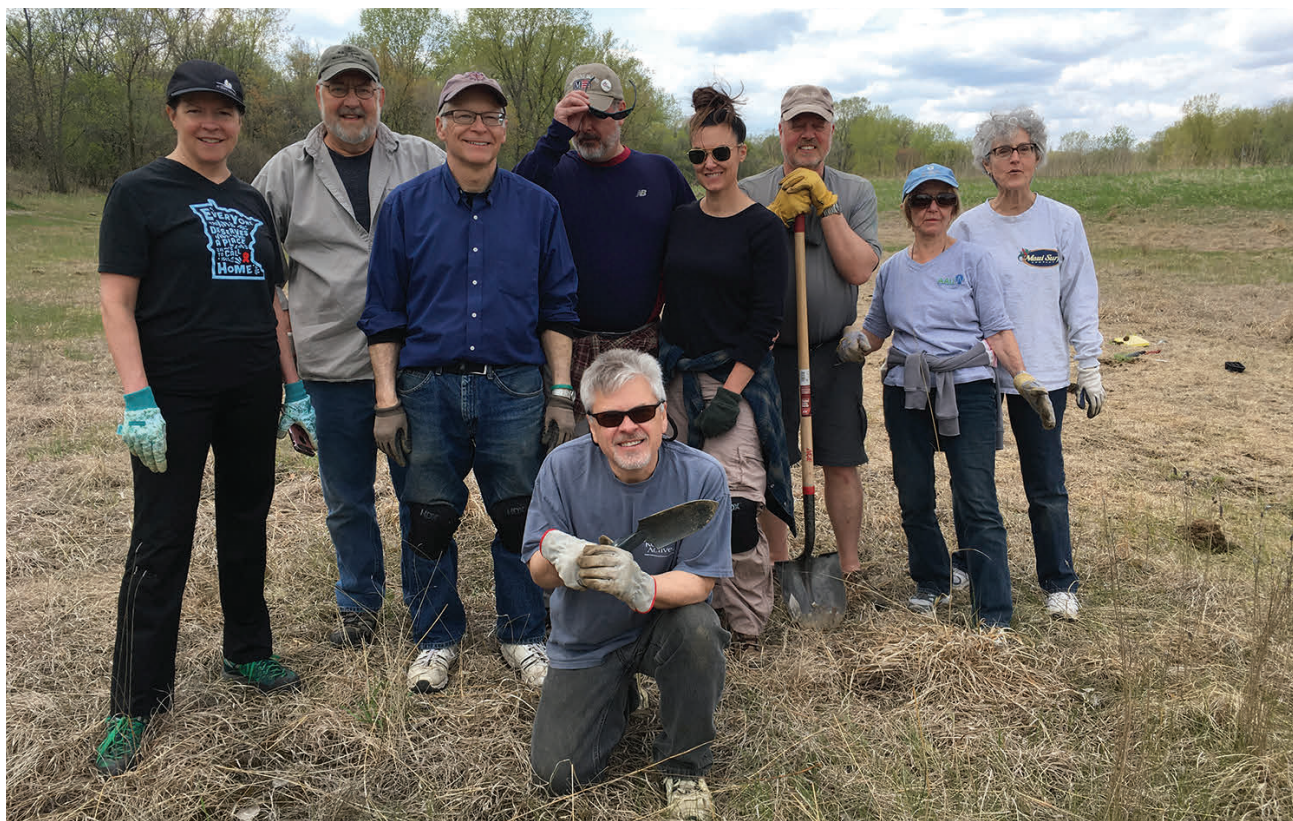
“CLPA Volunteers planted over 1,000 native specie flowers and grasses in the Cedar Lake Park Prairie in May 2019”

went out and shot footage of what has happened this year as clearing has begun in advance of construction. We will be out there once construction is over so we can get a “before, during, and after” view of the corridor. We also commissioned paintings of the corridor and we plan on making prints of them to put up in the corridor.