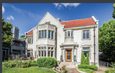
2212 W Lake Of The Isles Pkwy, MPLS $2.849M