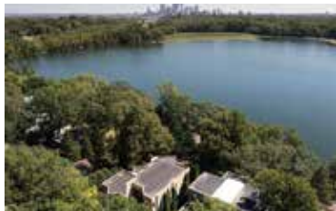
1964 Cedar Lake Pkwy Mpls, $999,000