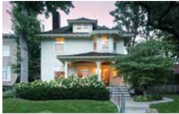
2225 E Lake of the Isles Pkwy Mpls, $3.15M