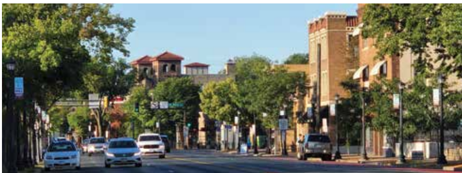
Hennepin Avenue at intersection of W 25th Street (Photo Tim Sheridan).

Hennepin Avenue is a critical transportation corridor that will be transformed for future generations. The goals of this project are to improve conditions for all modes and make the corridor even greener.