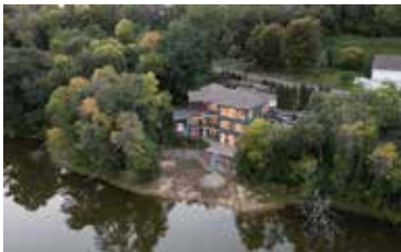
5966 Blackberry Trail Inver Grove Heights, $1.35M