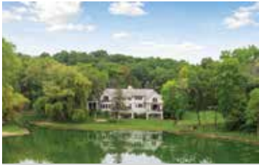
6604 Indian Hills Rd Edina, $4.995M