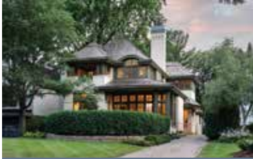
4716 W Lake Harriet Pkwy Mpls, $2.65M