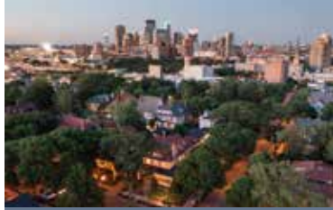
1725 Dupont Ave S Mpls, $1.495M