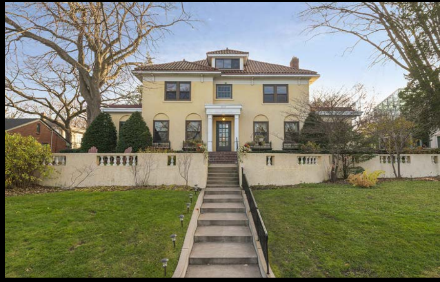
3515 CEDAR LAKE AVENUE. Classic 1920 Mediterranean-style residence with spectacular views of Cedar Lake. Well-appointed public rooms with coved ceilings, panel moldings, hardwood floors. Special mezzanine-level family room with barrel-vaulted ceiling. Lower level has amusement room with terrazzo floor and unique wine vault. Lovely yard with stone patio and separate garden area. $1,245,000