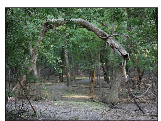
After the goats.