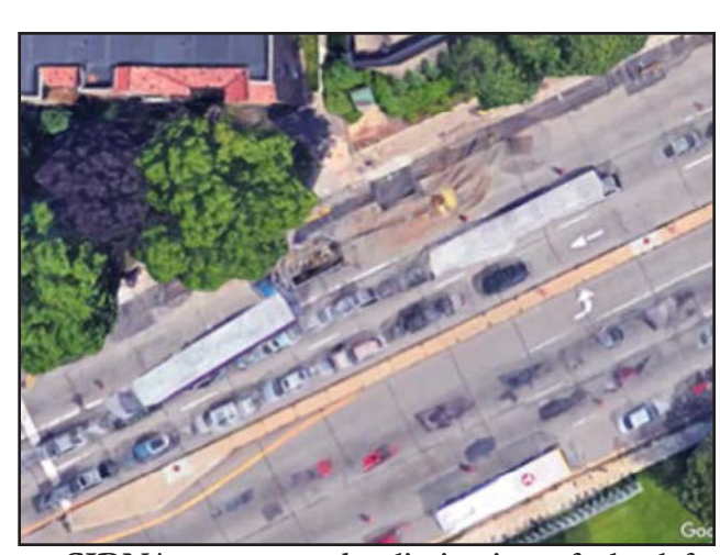
CIDNA recommends elimination of the leftturn bump out in the lower left corner of this photo at the intersection of West Lake Street and Dean Parkway.