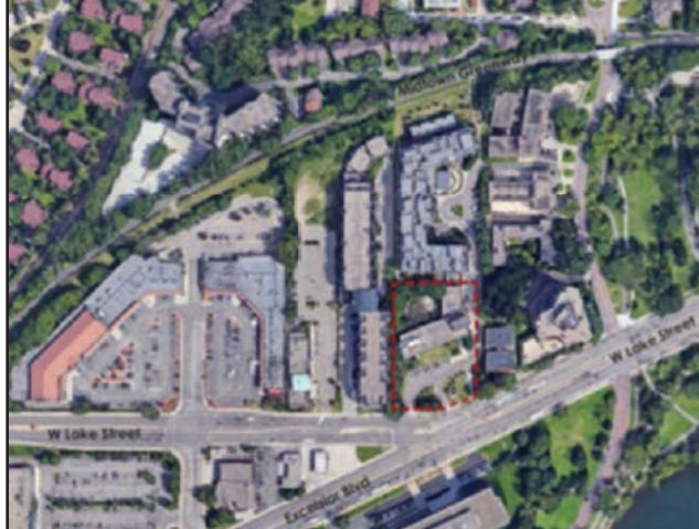
CIDNA proposes to eliminate the left turn lane. lane. Source Brickstone Partners and ESG Architects