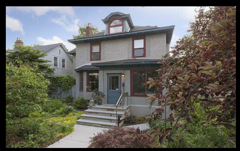
3308 IRVING AVENUE SOUTH. Just a block to Lake Calhoun! Beautiful built-ins, including dining room buffet and fireplace mantle wall. Large living & dining rooms. Terrific Otogawa-Anschel renovated kitchen that connects to a large deck in the private backyard. Three bedrooms up, including a fantastic owners' suite with gas fireplace, walk-in closet, bath with steam shower and deck with seasonal lake views. $734,000