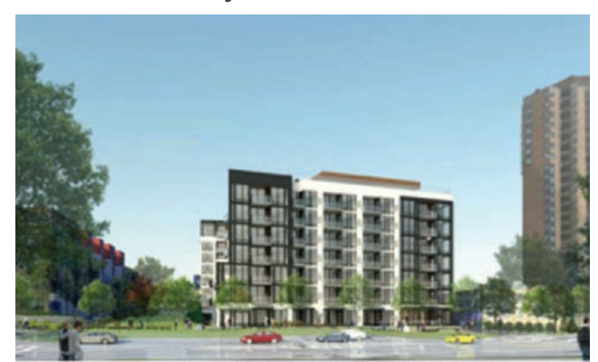
Rendering of street view for proposed 8-story Brickstone apartments at 3100 West Lake St.

Source: Brickstone Partners and ESG Architects