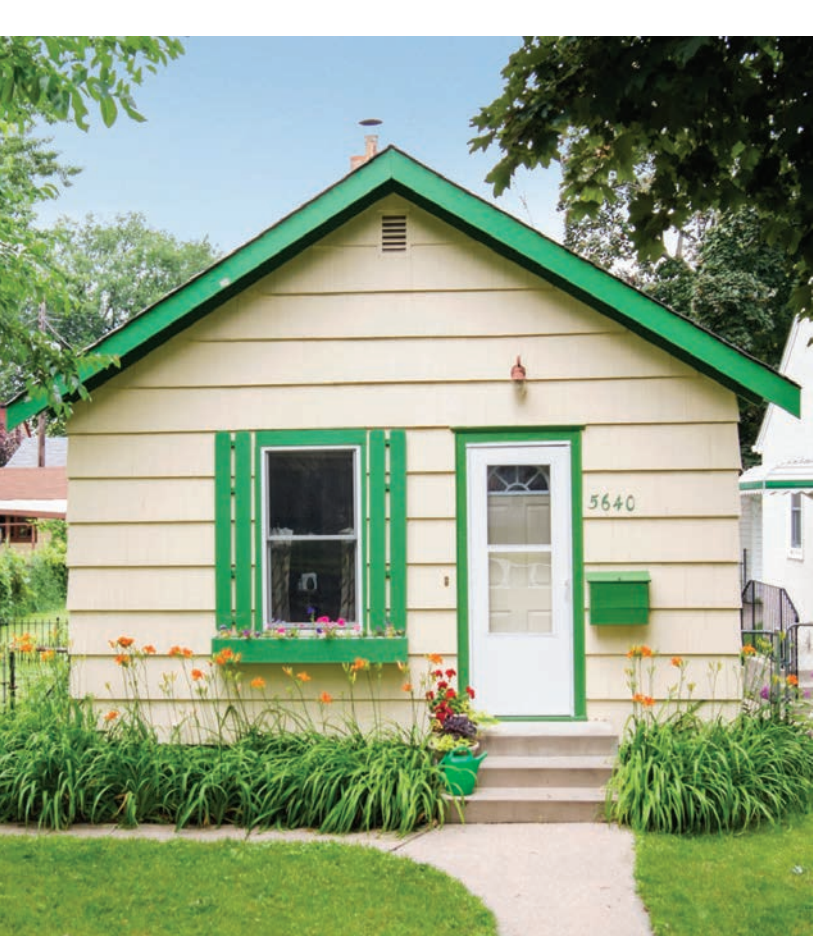
26,000 Square Feet