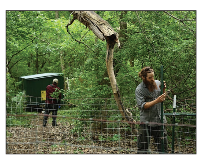
Before the goats.