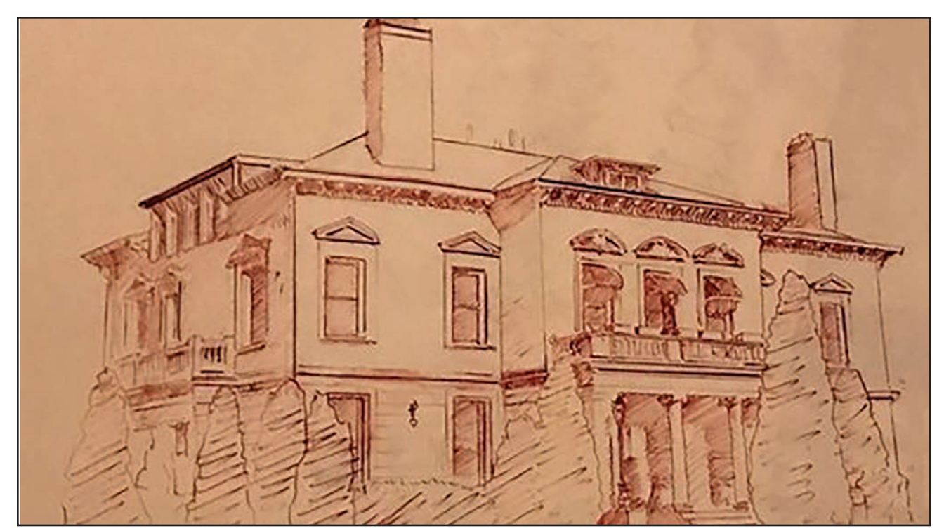
1300 Mount Curve Avenue