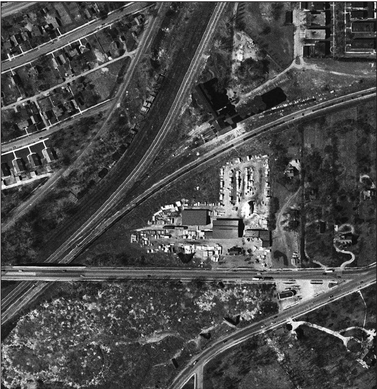
Photo courtesy Tony Kuechle, Doran Companies. Caption: Michael Wilson

Several new and/or expanded landscape islands are proposed within the existing parking areas. The increased size of these islands will provide greater soil depth and area for root expansion which will allow for larger, healthier overstory shade trees. The preferred landscape plan approved by the city calls for 3,997 square feet of additional green space, 49 additional