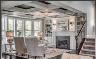
705 Niagara Lane N, Plymouth $1.075M