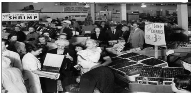
Shopping the fruit and seafood departments at Lunds today is more leisurely and less crowded than it appears to have been in this 1943 photo of the Uptown Hove's.