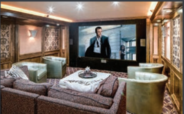
4888 W Lake Harriet Pkwy, MPLS $1.599M