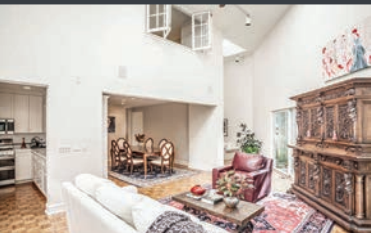
1505 Mount Curve Ave, MPLS $1.15M

Bruce Birkeland 612-925-8405 bbirkeland@cbburnet.com bbirkelandgroup.com