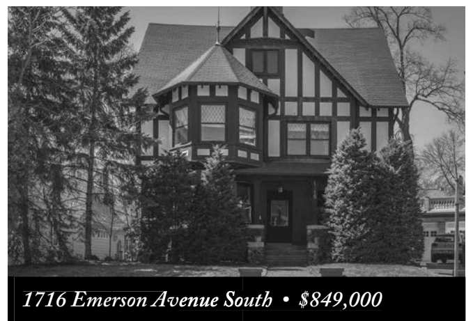
1716 Emerson Avenue South • $849,000

This 5 bedroom, 4 bathroom Lowry Hill English Tudor comes with many unique features: a fireplace in the kitchen, formal and informal living spaces, and hand-carved quotations in the living room.