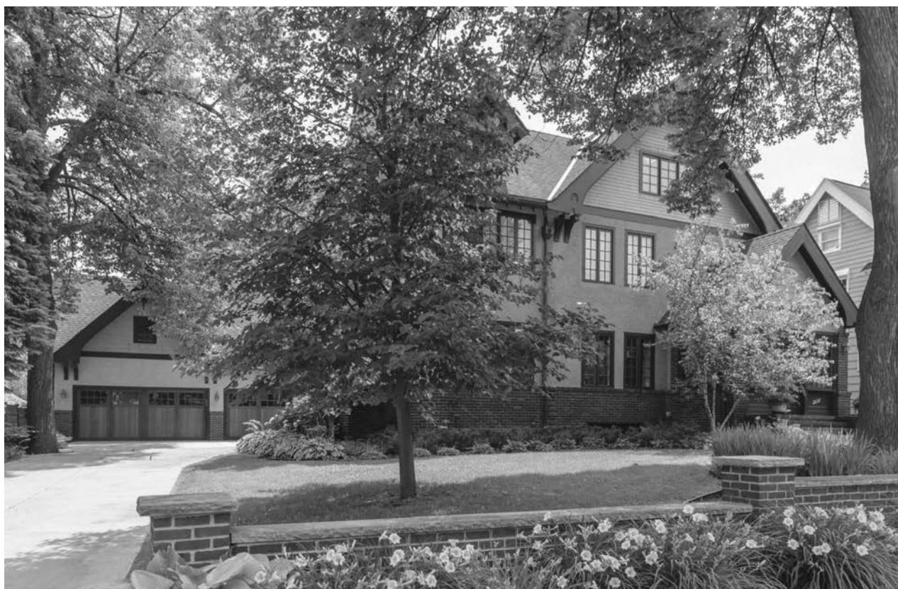
A Rare Find • 2227 West 21st Street • $2,249,000