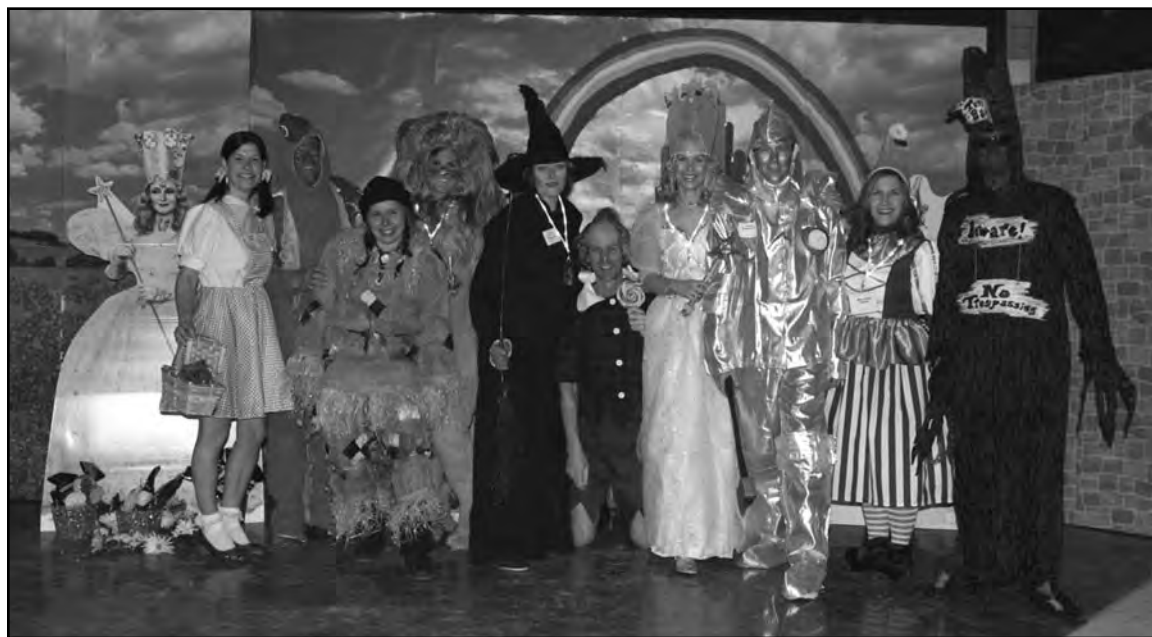
Kenwood School parents enjoy "Emerald City" event held at Kenwood Gymnastics Center