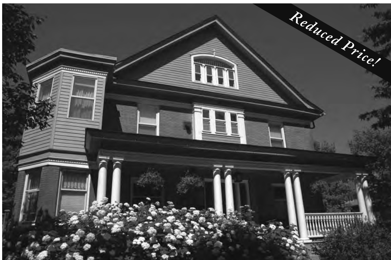
Lowry Hill Luxury • 2000 Humboldt Avenue South • $1,095,000

If you would like to learn more about these green events and future activities at Kenwood, you can check the website at www.knwood.mpls.k12.mn.us .