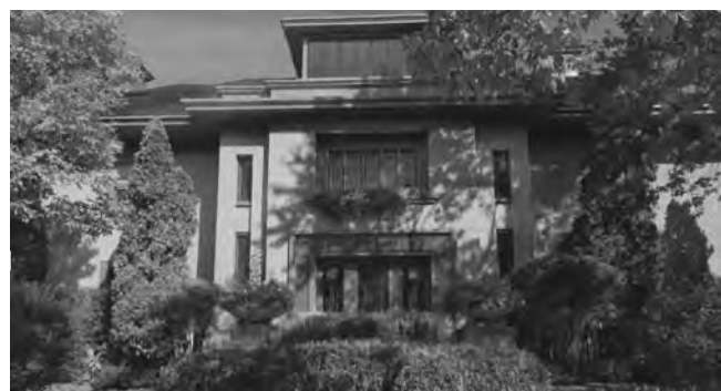
1324 Mount Curve Avenue • $2,495,000

Built in 1910 by noted architect George W. Maher, this 5 bedroom, 7 bathroom masterpiece has many rooms suited for executive entertainment. Luxurious master suite, remodeled kitchen, china pantry, private solarium, music room, carriage house, and 3-car garage.